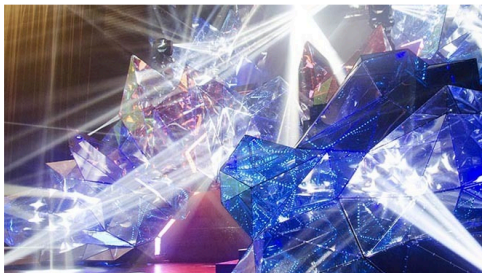
Krewella's Crystal Volcano,