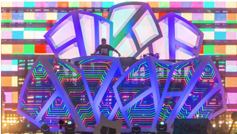
Dillon Francis's The "Gary,"